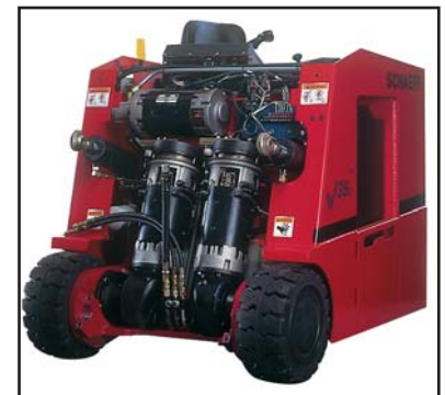
Rugged, organized design increases reliability and simplifies maintenance.