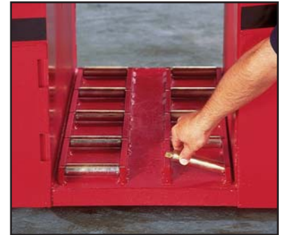
Plated steel battery rollers are easy to remove for proper servicing.